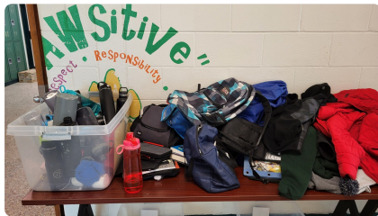
Lost and Found