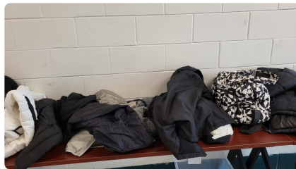
Lost and Found