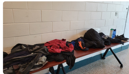
Lost and Found